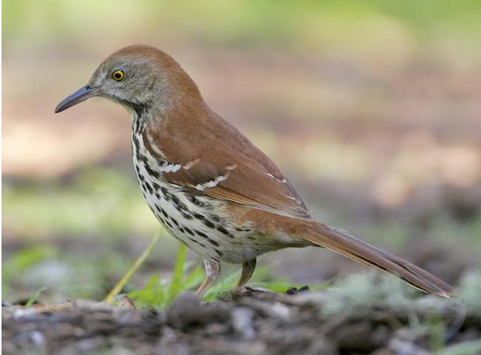
Brown Thrasher Toxostoma rufum